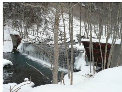
Unmodified dam on Iwauketsu River