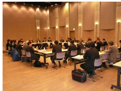
Meeting with local stakeholders